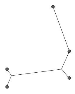
Figure 1: A Steiner tree connecting points at (.7,.96), (.88,.46), (.88,.16), (.19,.26), (.19,.06) (where (0,0) is in the lower left corner, and (1,1) in the upper right). There are two Steiner vertices, at roughly (.24,.19) and (.80,.26).

a pretty sophisticated idea of why we have no idea [61]. See [68] or [39] for more information.