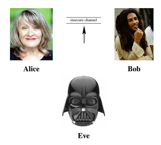
Figure 2: Communication between Alice and Bob, with Eve listening

In the basic scenario in cryptography, we have two parties who wish to communicate over an insecure channel, such as a phone line or a computer network. Usually, these parties are referred to as Alice and Bob. Since the communication channel is insecure, an eavesdropper, called Eve, may intercept the messages that are sent over this channel. By agreeing on a secret key k via a secure communication method, Alice and Bob can make use of a cryptosystem to keep their information secret, even when sent over the insecure channel. This situation is illustrated in Figure 2.